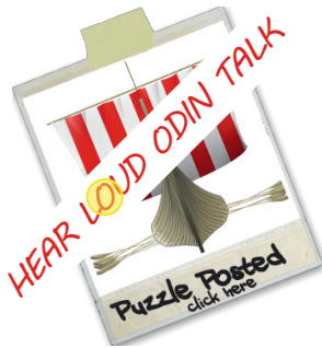
August 2021 Vikings