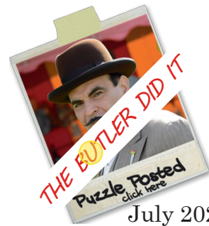
July 2021 Agatha Christie's Poirot