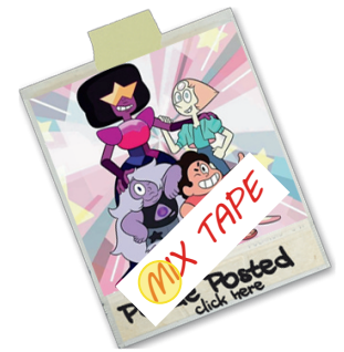
May 2021 Steven Universe