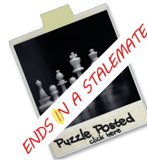
June 2021 Chess