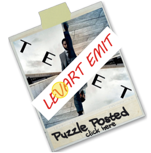
September 2021 Tenet