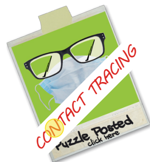
March 2021 Life in 2020