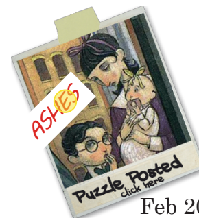
Feb 2021 A Series of Unfortunate Events