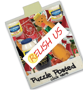
October 2021 Condiments