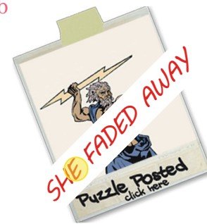
April 2021 Greek Mythology