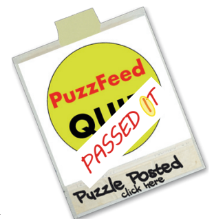
January 2021 Puzzfeed