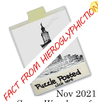
Nov 2021 Seven Wonders of the Ancient World